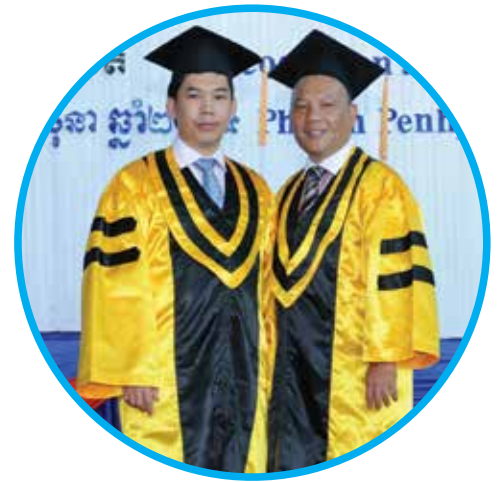
Our Board of Directors' Chairman and Vice-Chairman

Dear Parent of a Prospective CIA FIRST Student